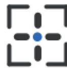
Precision within 1mm