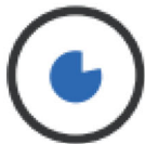
Instant Graphic Recognition